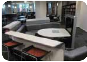
Small Group Concept

In an effort to migrate the CDM Library's educational model to a modern learning environment, the CDM Foundation Board has voted and approved a $400,000 allocation of funds which may be the biggest single donation contribution in the school's history. The CDM Foundation, in concert with our Principals, has approved the full first phases to completely remodel/renovate the main campus Library. If approved by the NMUSD school board, the CDM Foundation will use the generous donations from many CDM Families to add multimedia, tablet stations, private student project rooms, full class tech room, improved private office space, team tech work areas, parking lot main entrance, smooth flow to/from the Student Resource Center (SRC), all the furnishings, tablet support station, and much more. Many research sources, periodicals, and certain books will be migrated to electronic format, while specified fiction and other more commonly checked out books will be more efficiently shelf organized; all to make the most efficient use of space and various technological opportunities now available in modern education. Thank you to our Foundation contributors, our Fund-a-Need Neptune Ball donors and thank you to our Principals. Without this generous support the educational enhancement of our outdated library would not be possible.