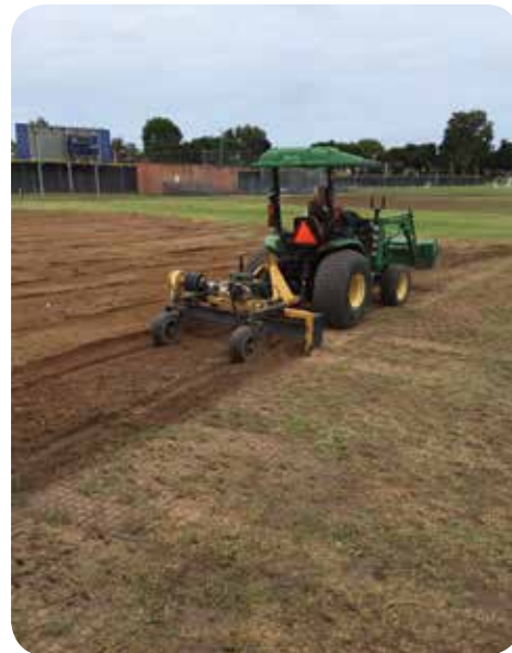
During the Renovation

Due to the deteriorating condition of this field and lack of funding from the school district for repairs, The CDM Foundation deemed this project a top priority for the summer. The Foundation collaborated with the City of Newport Beach Water District to provide recycled water to the game field and top soil was donated to us which will reduce the field's water needs up to 50%! In addition, to ensure the field is properly maintained after renovation, The Foundation has reached an agreement with the school district to fund ongoing supplemental maintenance.