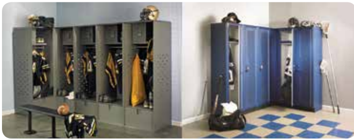
Concept photo of lockers.

The Foundation, PTA and Boosters are all allocating funds for NEW shared sports lockers so our CDM athletes no longer have to drag their bags and equipment around or drop them by the Athletic Office. The 95 New Sports Lockers are 72" tall and will be installed around the perimeter of the gym. Go Sea Kings!