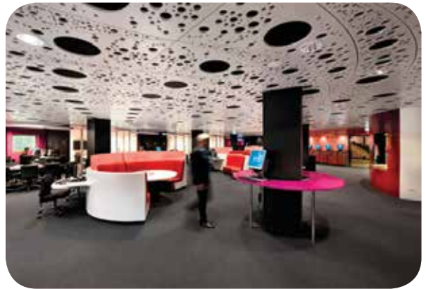
CONCEPTUAL | LIBRARY RECEPTION

It's not your granddaddy's library; in fact, it's not a library at all, it's a Student Learning Center, an open-source development laboratory. The next signature project for the CDM Foundation will be the planning, construction and implementation of the current 1960's-era school library into one for students of the 21st century. This remodel will give a lesser presence to cloth-bound books and more to technology, including computer stations, active-study areas, projectors, drop-down screens and eBooks. Gone will be the view-blocking stacks of books, replaced by a see-through model of waist-high counters and open areas, along with casual seating instead of rigid seats at tables. The new look will speed up the learning process, encourage creative thinking and collaboration, and also introduce our students to current levels of technology. Talking will not just be OK, but encouraged for the exploration of new ideas. Projection equipment will allow students to train in skills that will be used in their careers. Construction is to begin in the summer of 2015 and the project is to be ready for the school year that fall. The CDM Foundation greatly appreciates the generous donations of our families which will make possible this important upgrade; thank you, CDM parents!