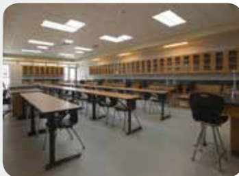
Middle School Enclave Dry Lab