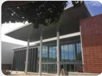
Front exterior of Performing Arts Complex

Dear families of Corona del Mar High School and Middle School,