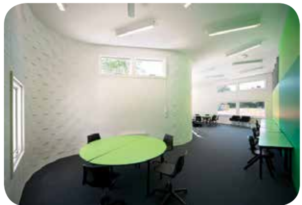
CONCEPTUAL | LIBRARY IN GREEN