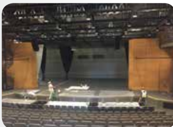
Interior of Performing Arts Theater

A huge Thank You to all the parents who have supported us with over $11,000,000 these past 19 years! The CDM Foundation has put that money to work in a variety of ways: extra counseling positions, academic support, technology upgrades, gym, quad and room remodels, and field renovations. We exist to bridge the gap between the increasing cost of education and the insufficient funds from the district and the state, so we look to the parents to support this additional and necessary funding. This extra money helps prepare our children for the college admission process and the 21st century job market. We have traditionally been supported by 20% of the parents, and we thank you wholeheartedly. For the other 80% who have not had the opportunity to donate, we welcome your help. No donation is too small. Please read below to see what we are doing for all CDM students, from musicians to robot programmers, and from athletes to the next tech start-up entrepreneur.